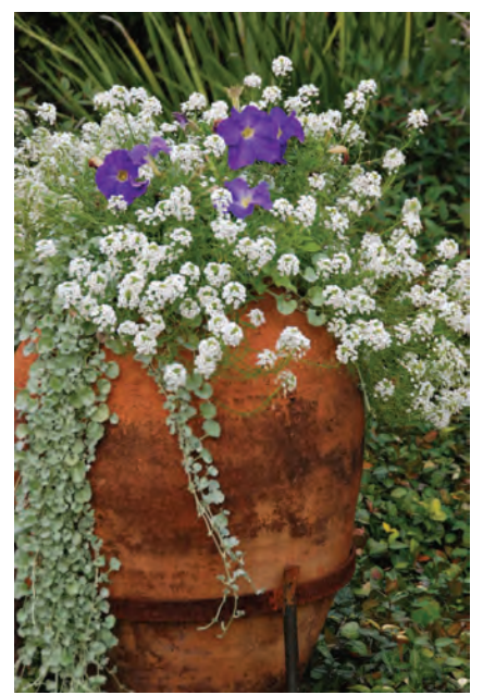
Snow Princess alvssum with petunias and Silver Falls dichondra

containers along the walkway in front of our house. Drive by and see how it looks when the summer heat has many other plants gasping.