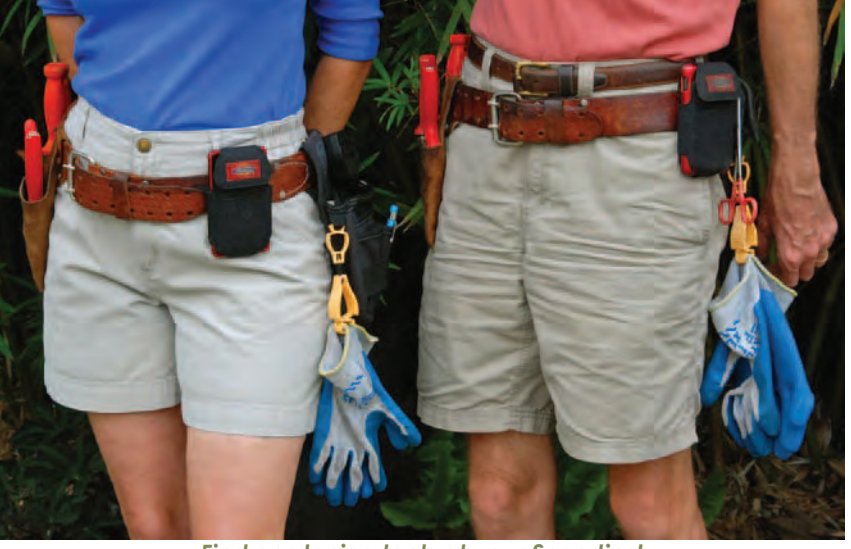
Find gardening tools at your fingertips!

Now we can't blame our memories (800-871-8158 or www.leevalley.com).