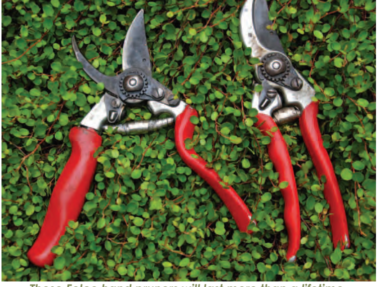
These Felco hand pruners will last more than a lifetime.