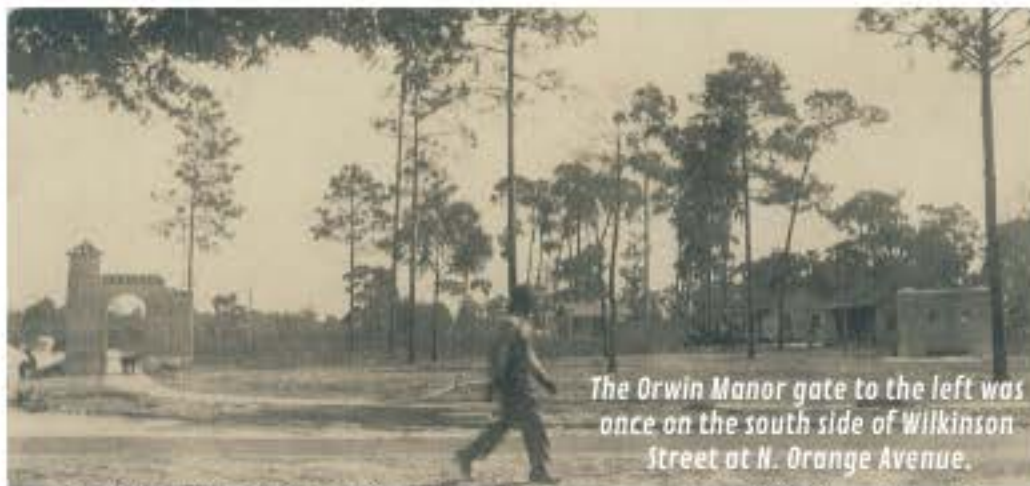
The Orwin Manor gate to the left was once on the south side of Wilkinson Street at N. Orange Avenue.

The Centennial Committee is a large one – every OMA resident is nominated to participate and help in the activities that started this autumn and extend through 2024. Please share your ideas, offers of help, and enthusiasm by emailing spategas@hortusoasis.com .