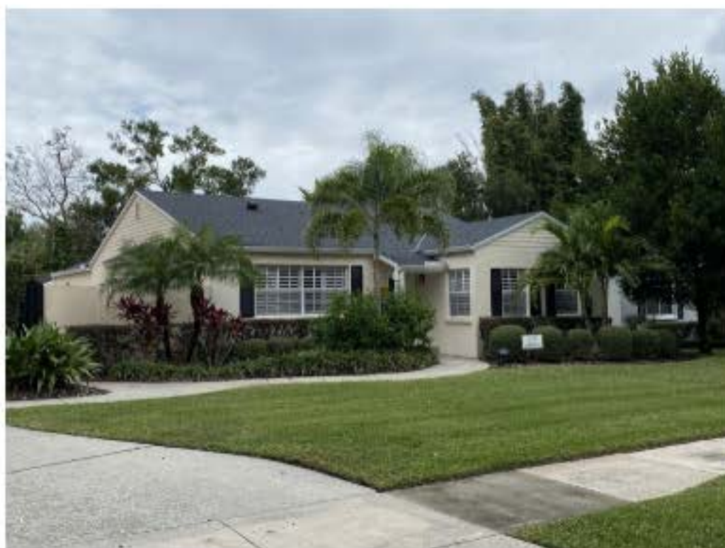
Nov/Dec 2021 Yard of Distinction Berit Amlie, 1531 Cavendish Rd