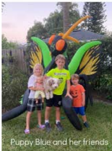
Puppy Blue and her friends