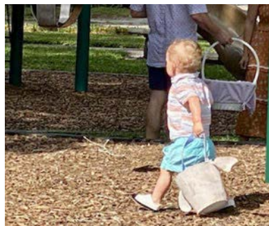
Determined to find more eggs.