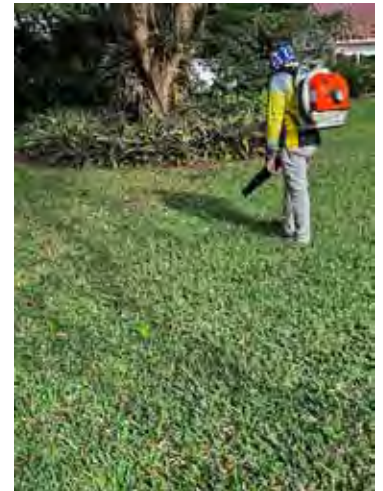
Electric blowers only in 2024.

• Avoid a ticket from the police. By code, vehicles must not block sidewalks that are for pedestrians and not parking.