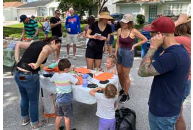
The Devon Road Block Party