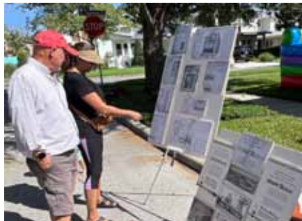
OMW history display at the block party.