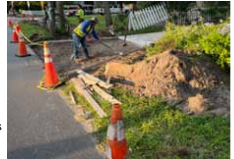
Sidewalk installation along Clay Street.

• New Event Signs - Our old signs have dwindled. We are in great need of donations to cover the $550 cost of new event signs with our logo and a QR code linked to our website. When our new signs are in use, please help preserve them until they are picked up by one of our volunteers. If one needs to be rescued, please store it safely and contact info@orwinmanor.org .