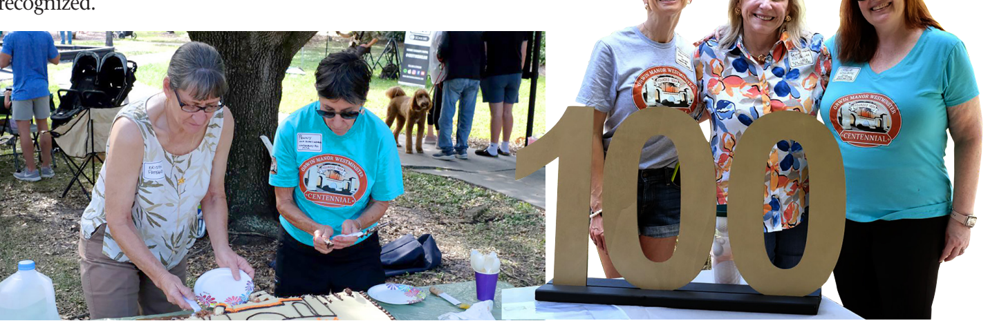
Above, the November Orwin Manor Centennial celebration featured cake, dignitaries and neighbors enjoying the day.

We are proud to have Home Boys | Serhant, Delaney Crosscountry Mortgage, Advent Health, McLaren, Commerce Bank & Trust, Demetree Global as our OMWA Neighborhood Sponsors for a year.