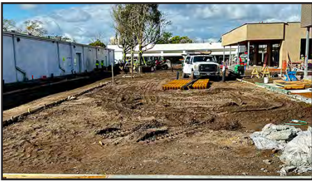
Continued on page 7.

The Winter Park Business Center on Minnesota Avenue being renovated into a walkable, 18-hour mixed-use destination is on track to open in early 2026. The roadway along its east side has reopened so the easy access to Publix we enjoy is now available again.