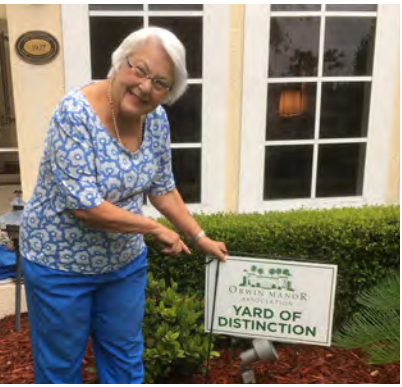
From page 4.